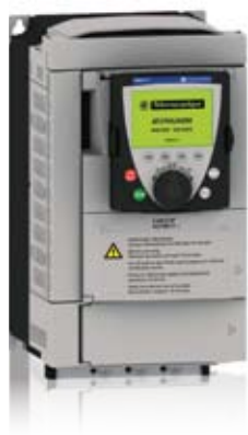
Altivar 71 drive